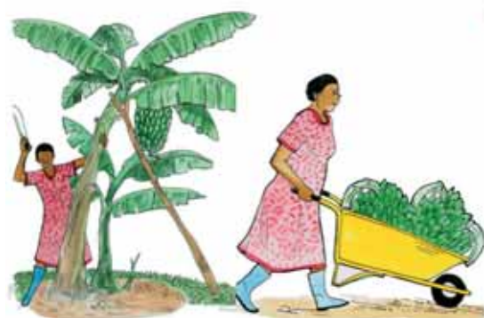
Take care that the bunches do not fall to the ground