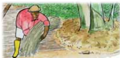
Apply mulch or grow a cover crop