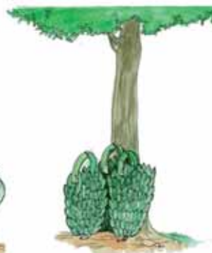
Harvested bunches should be kept under the shade and should not be heaped together