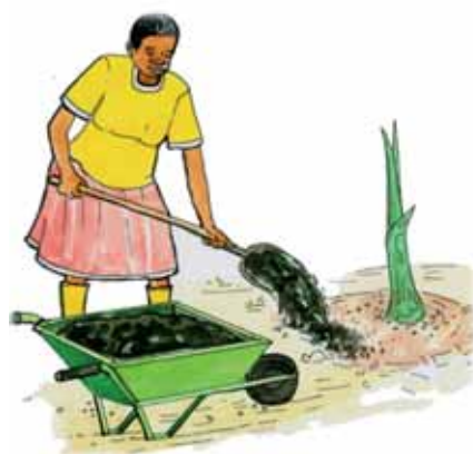
Add compost to the planting hole