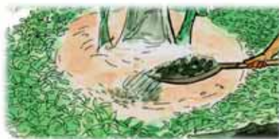
Regularly apply compost and grow cover crops